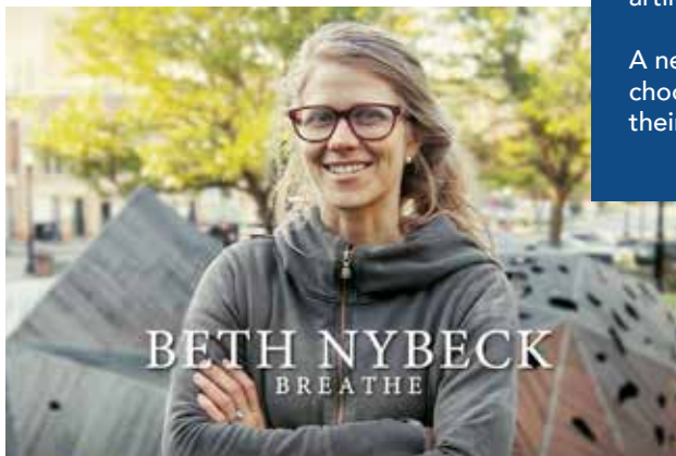
Still shot from film by Cody Hunt.