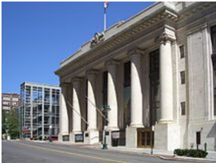
A. The facade of the library and sidewalk are sites for artwork.