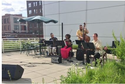
Cucharada performed on the library's rooftop in 2017.