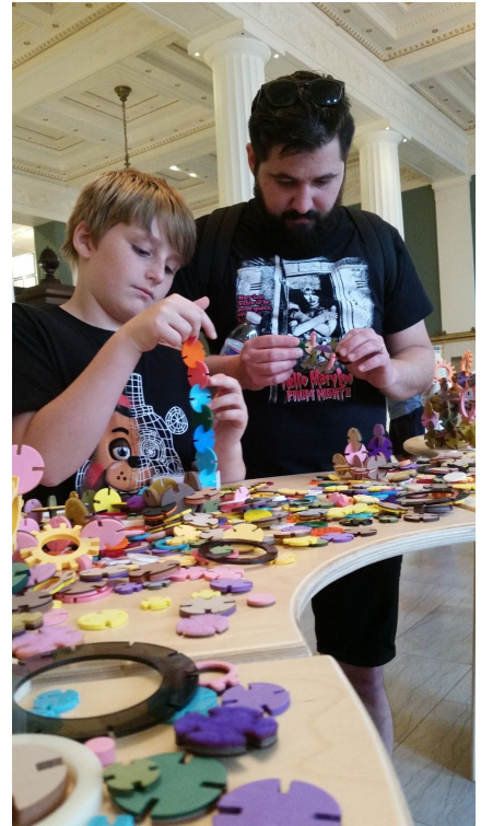
Wearable Play , Sunyoung Cheong, 2018