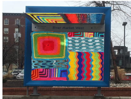
A. KC Streetcar Stop: Streetcar Shelter Sweater , Emily Evan Sloan, 2018