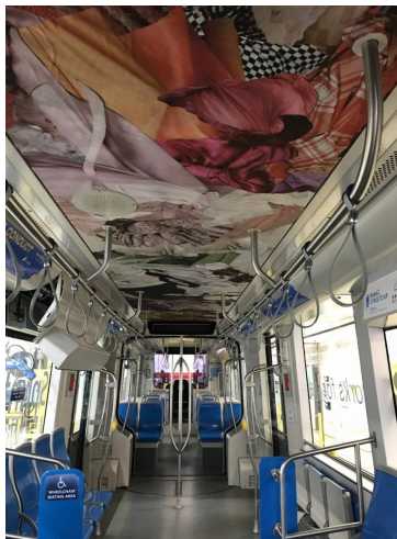
B. Vehicle Interior: Celestial Heap , Monica Dixon, 2018