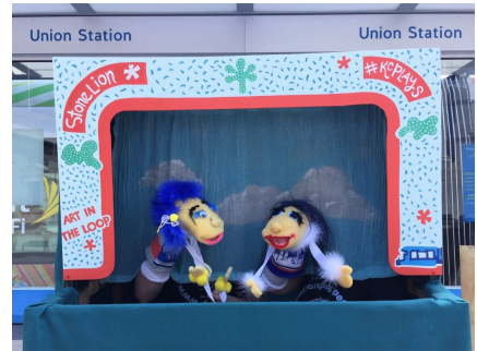
A. KC Streetcar Stop: KC Puppets at Play , Stonelion Puppet Theater, 2018