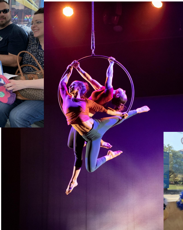
Circus Scorpis, 2022