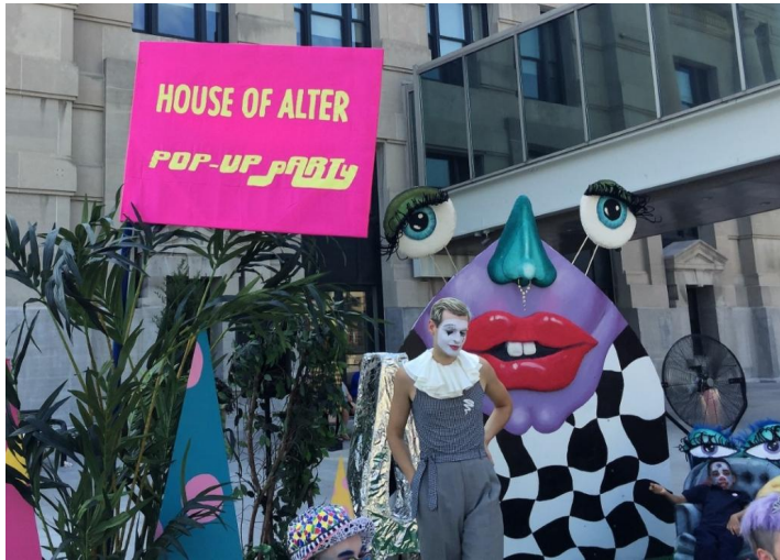
Alter: Pop-Up pARTy 2018