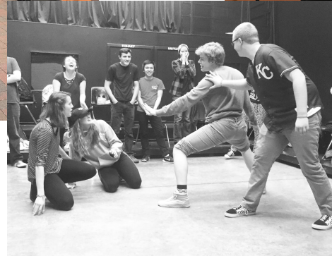
B.Hive Theatre, 2022