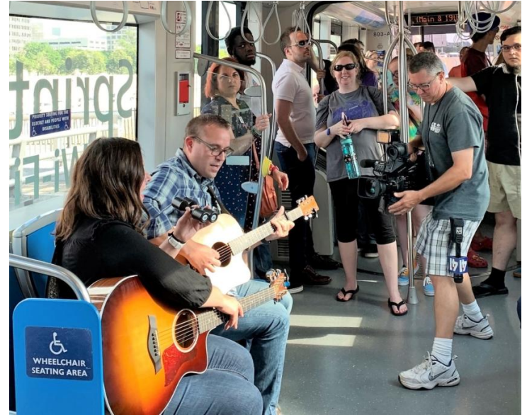
The Newkirks, 2019