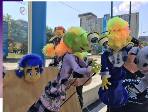
Stonelion Puppets 2018